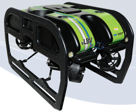
Applications: Small ROV